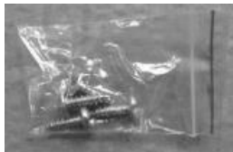
Screw Pack x 1