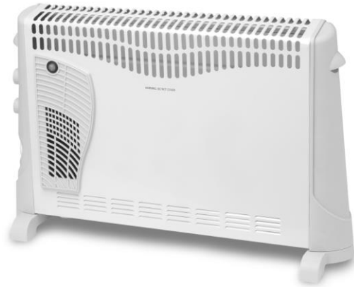
Main Body x 1