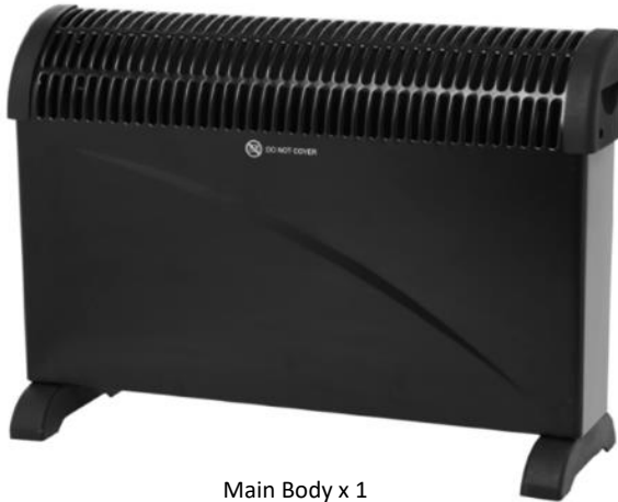
Main Body x 1