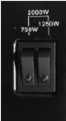
HEATER CONTROL SWITCH