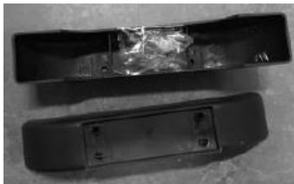
Feet x 2