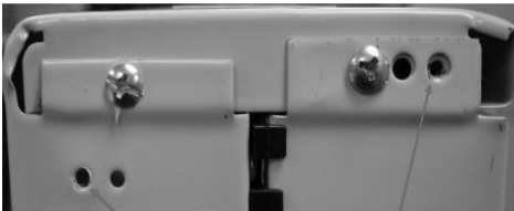
Screw holes in base of heater

The pictures below show the location of pre-drilled holes on the heater base.