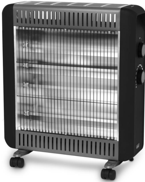
Main Body x 1