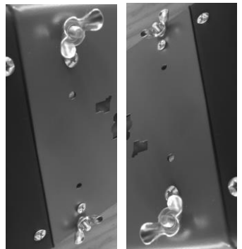
Wing Nuts x 4