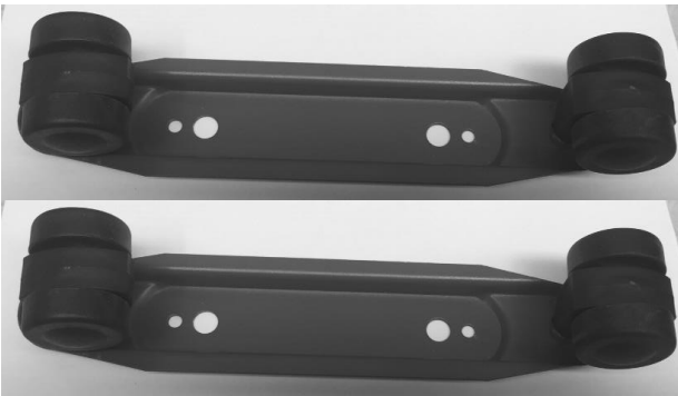
Wheel Plates & Castors x 2