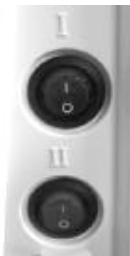
HEATER CONTROL SWITCHES