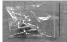
Screw Pack x 1