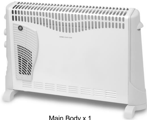
Main Body x 1