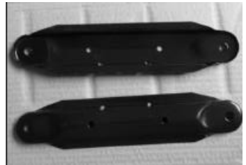
Castor Plates x2 (for 11 Fin Heater)