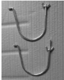
U-shape Bolt x2