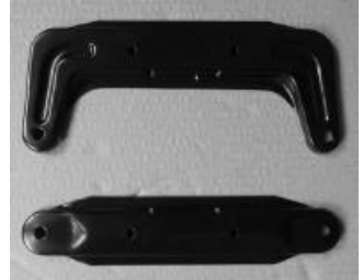
Castor Plates x2 (for 7 Fin Heater)