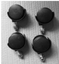
Castor Wheels x4