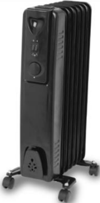
Main Body x1