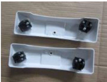
Feet with Castor Wheels x 2